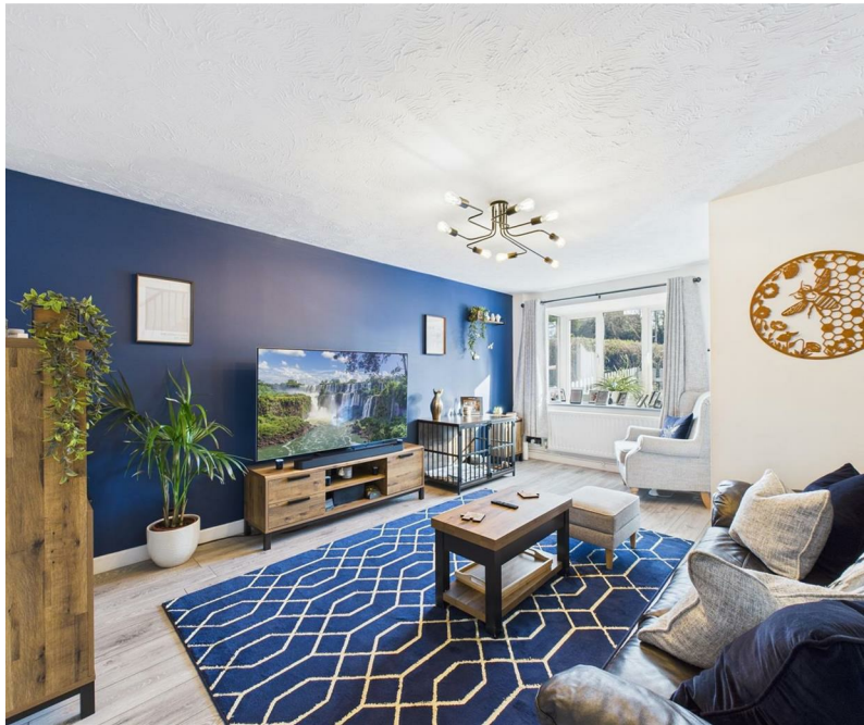
Bluebell Drive, Chippenham